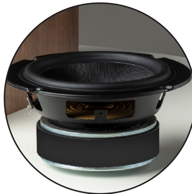
5" fiber glass bass/mid woofer

Extra dense acoustically optimized MDF. Allen screws fix the chassis mechanically perfect to the cabinet.